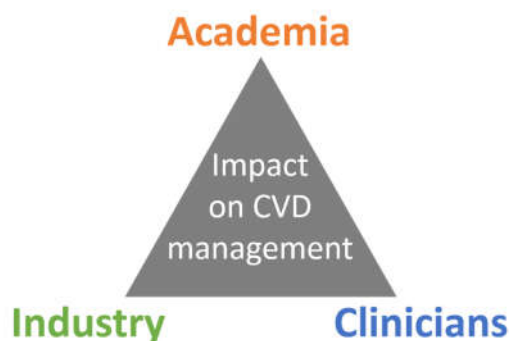
Figure 2. Different backgrounds of the network members and their interactions to impact cardiovascular diseases (CVD) management, thus healthcare.

This COST Action aims to accelerate the understanding of transcriptomics in CVD so personalized medicine advances faster in this field, addressing a current public health challenge. It proposes to constitute a network to offer opportunities for collaboration between clinicians, academic researchers from interdisciplinary backgrounds, and industry to achieve breakthroughs and allow the transfer of basic science into usable applications (Figure 2). CardioRNA aims to refine guidelines from the design to the analysis of transcriptomics data to enable better comparison between studies from different laboratories and reproducibility of results, facilitating the development of products.